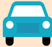
Travel to work for essential jobs.