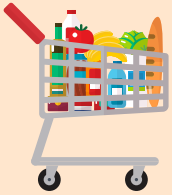
Food and household supplies.

You must stay home except for supplies and services like: