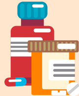
Medicine or medical care.