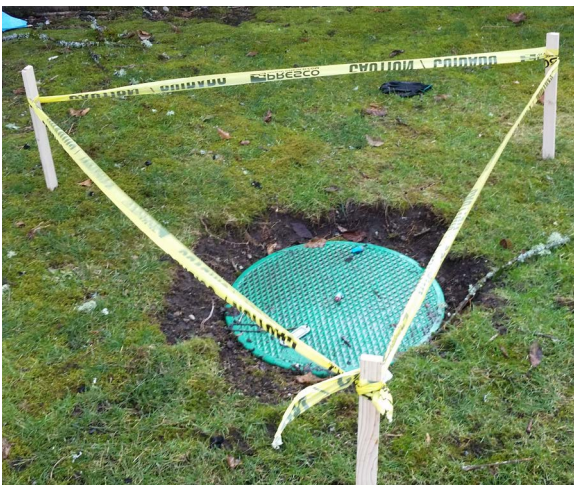
Unsecure Tank Lid Cautioned Off

Health Department staff will also leave a sign on the door of the home about the safety concern with the septic system.