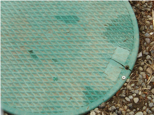
Cracked septic tank lid.

around any septic tank lids. Tell customers to avoid building structures over the drain field, and not to park cars or heavy equipment on the drain field.